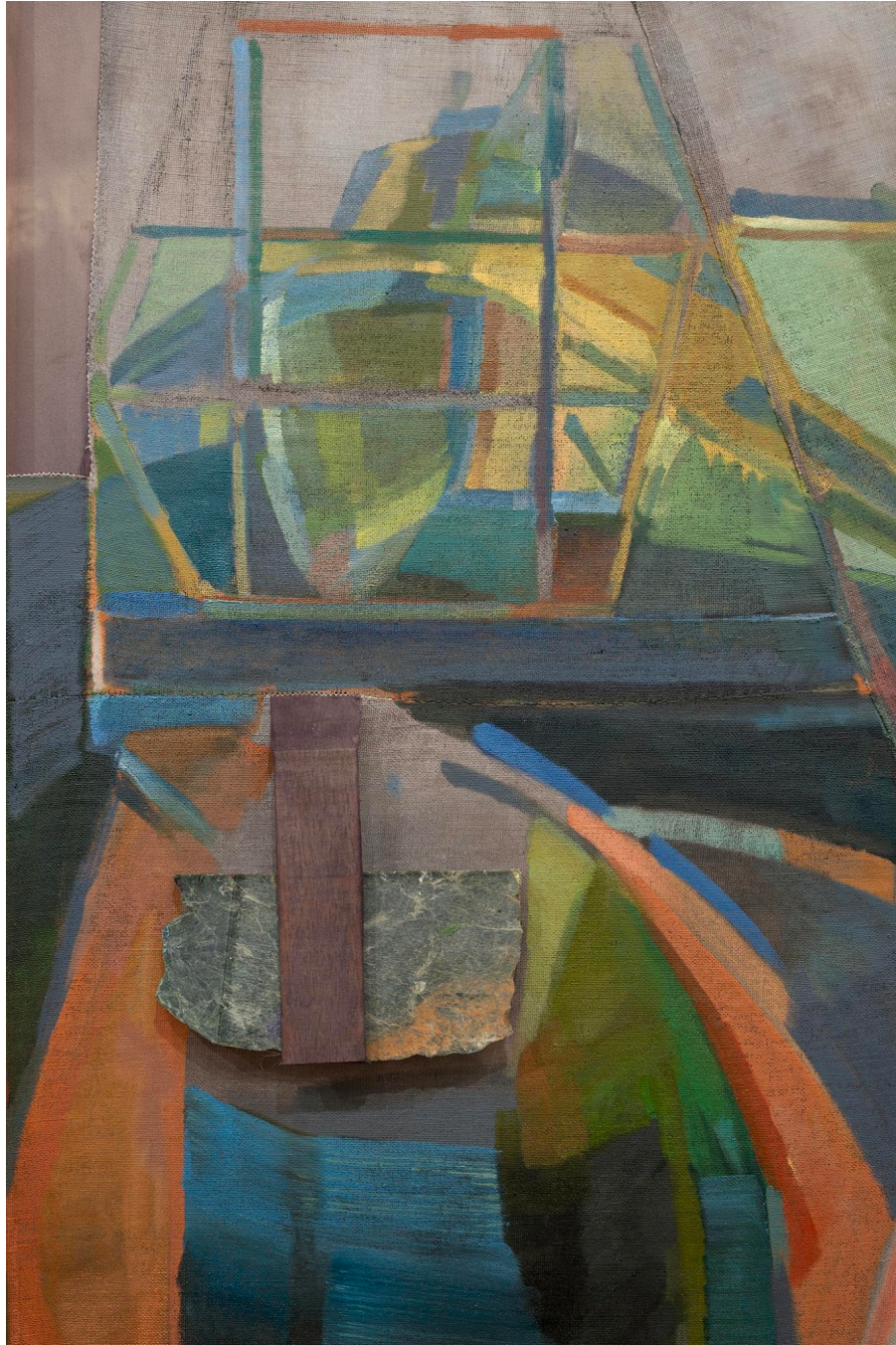
(Detail) Eleanor Conover, Your Heart is Not a Stone , 2025. Dye, oil, and graphite on sewn linen and polyester with marble and beveled pine; 45.5 x 33 x 1.5 inches.