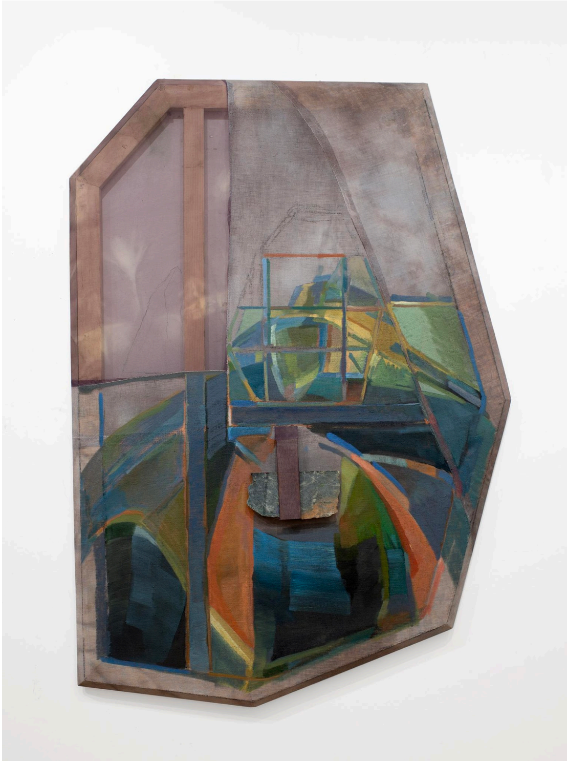
Eleanor Conover, Your Heart is Not a Stone , 2025. Dye, oil, and graphite on sewn linen and polyester with marble and beveled pine; 45.5 x 33 x 1.5 inches.