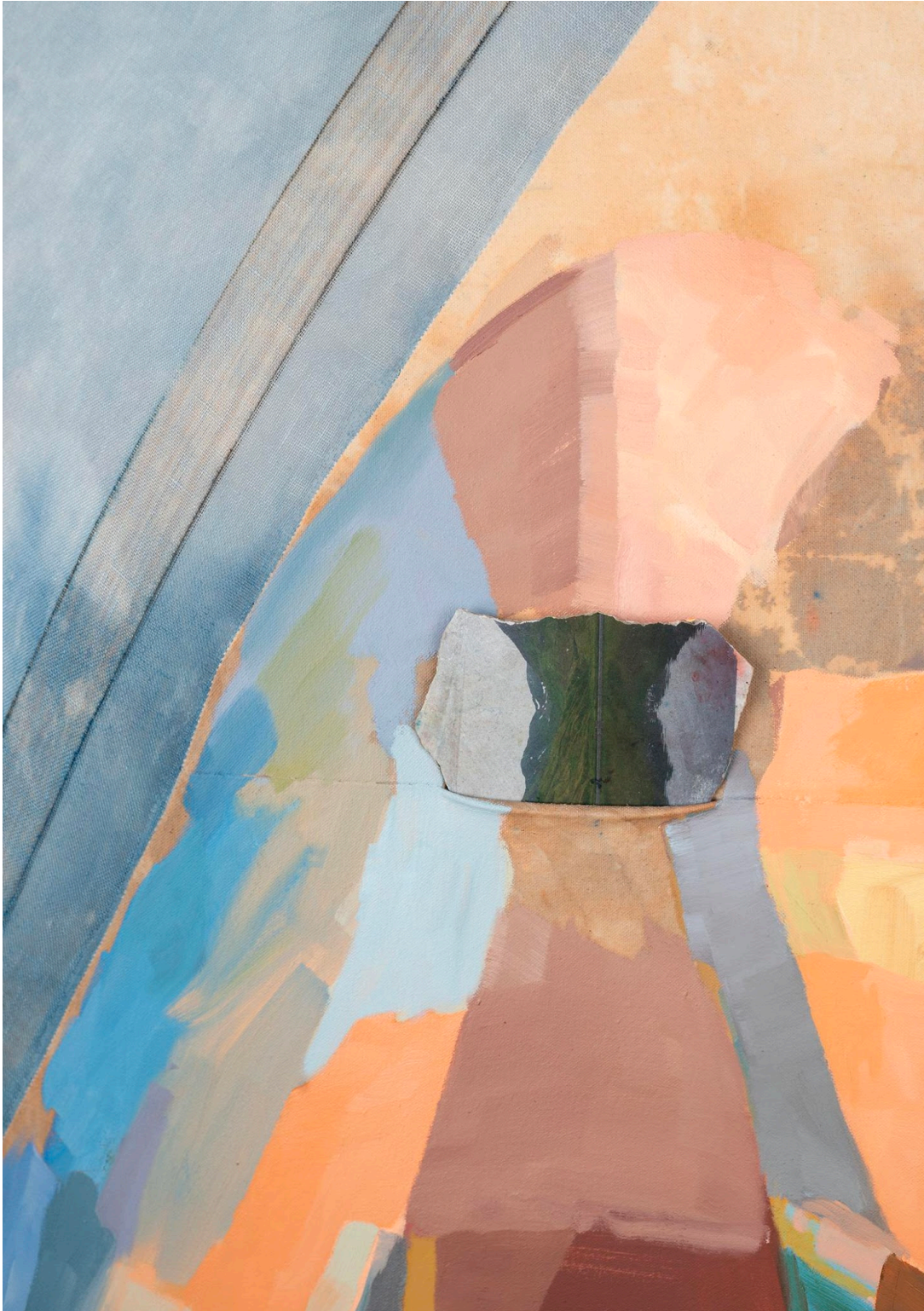
(Detail) Eleanor Conover, Mirror , 2025. Dye, oil, and graphite on sewn linen and canvas with bowed oak, beveled pine, marble, acrylic inkjet transfer, and granite; 49 x 34.5 x 4 inches.