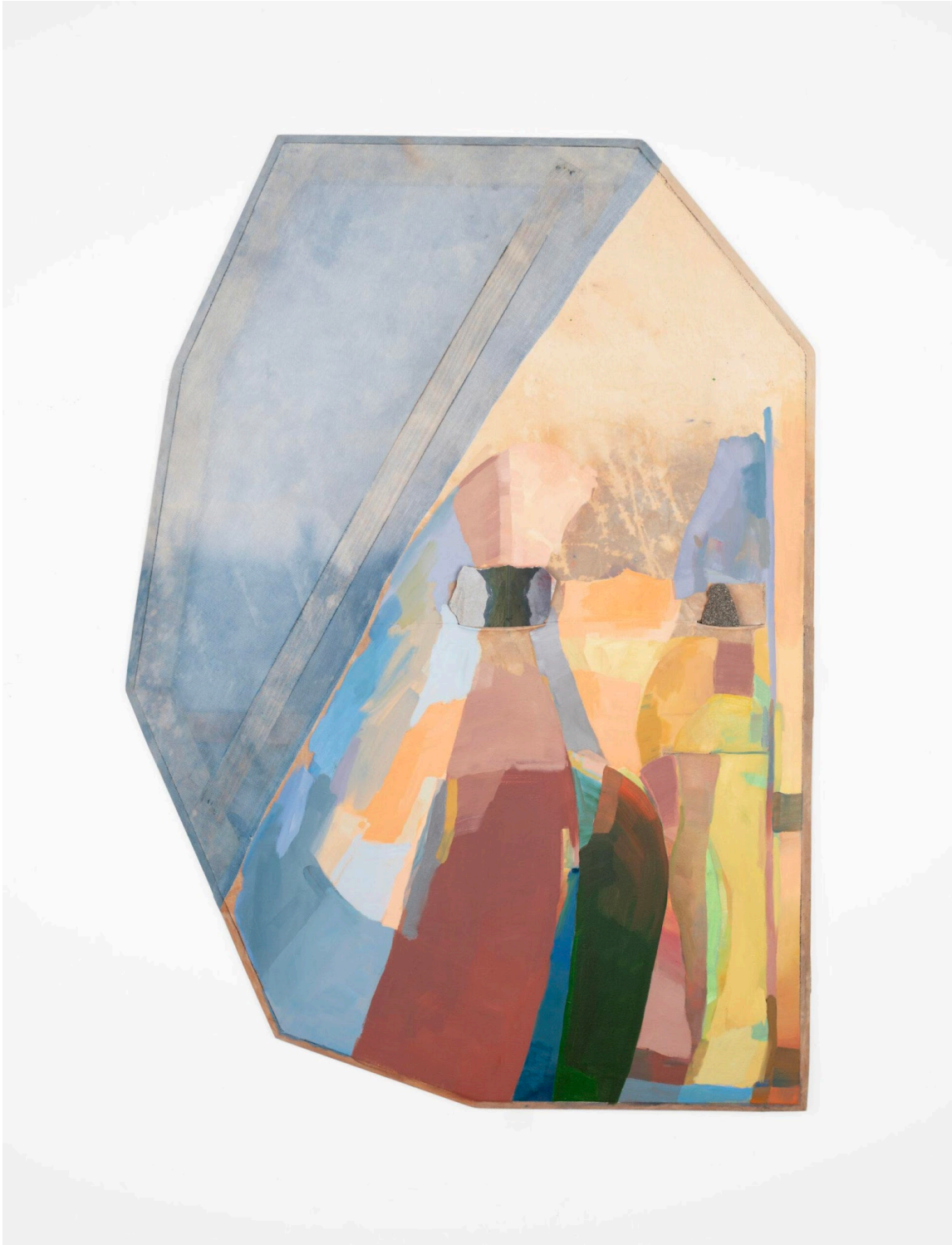
Eleanor Conover, Mirror , 2025. Dye, oil, and graphite on sewn linen and canvas with bowed oak, beveled pine, marble, acrylic inkjet transfer, and granite; 49 x 34.5 x 4 inches.