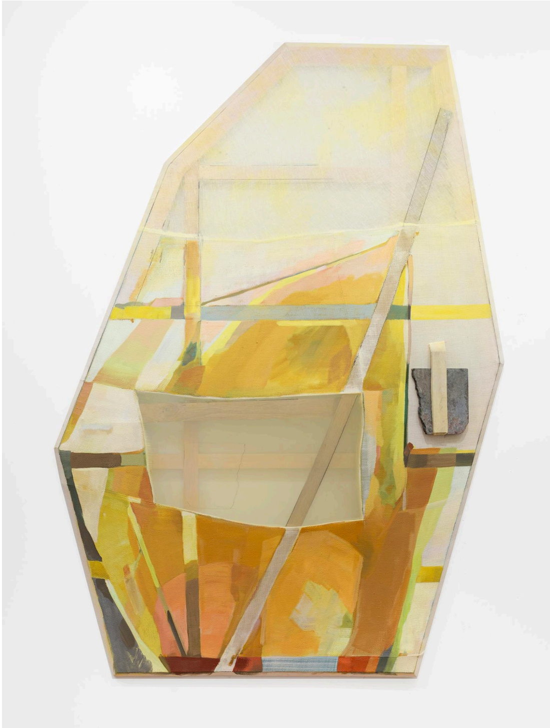
Eleanor Conover, From the Steep Slope , 2025. Dye, oil, and graphite on sewn linen and polyester with bowed oak, beveled pine, and marble; 63.5 x 43.5 x 4 inches.