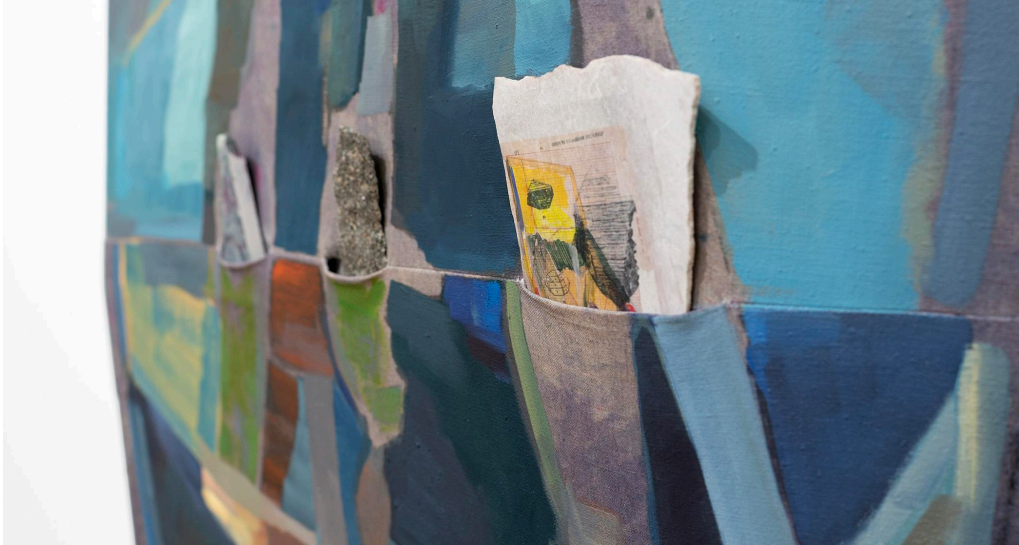
(Detail) Eleanor Conover, Before Between , 2024. Dye, oil, and graphite on sewn linen with marble, granite, bowed white oak, and beveled pine; 51 × 36 × 4 inches.