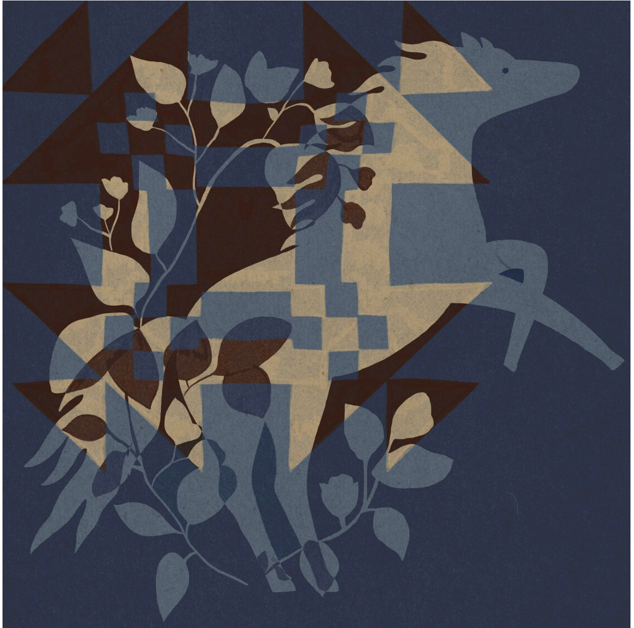
Horse / Goose in the Pond