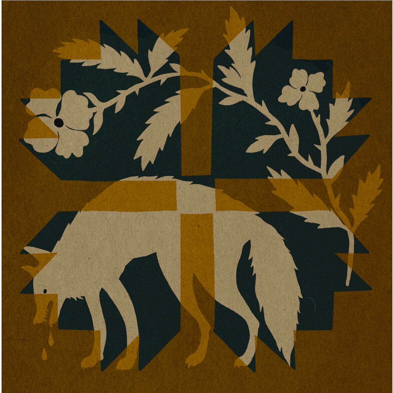
Wolf / Bearpaw