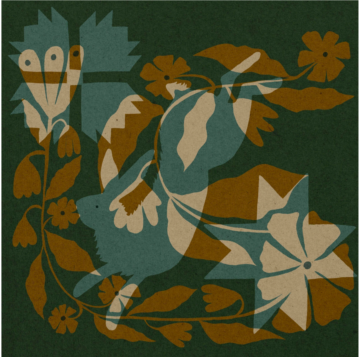
Rabbit / Ohio Star