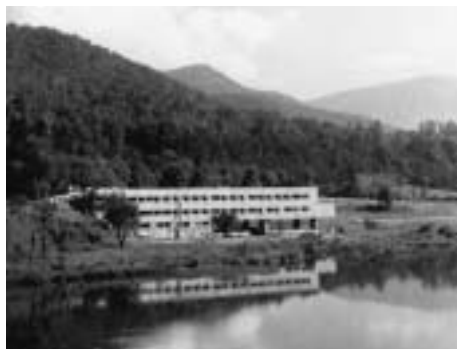
Second site of BMC, Studies Building reflecting in Lake Eden