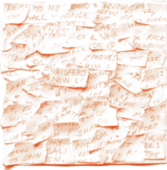
Secrets , 1949, pencil and collage on paper, 10" x 10"